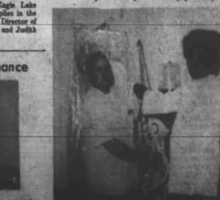
The Respiratory Therapy Department personnel test all Copiotestings, A.S.B.T., left, and Garret's Flowmeters, Inhalation Therapy technicians, right. Respiratory Therapy Department technicians test patients having difficulty in breathing; patients with pneumonia, asthma, emphysema, bronchitis and other related vital conditions. These treatments are given under the strict supervision of the physicians of the medical staff.