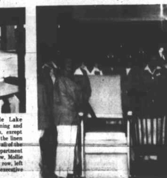
Pictured above are some of the members of the Eagle Lake Community Hospital Auxiliary proudly showing two pieces of equipment recently purchased and donated by them to the hospital.